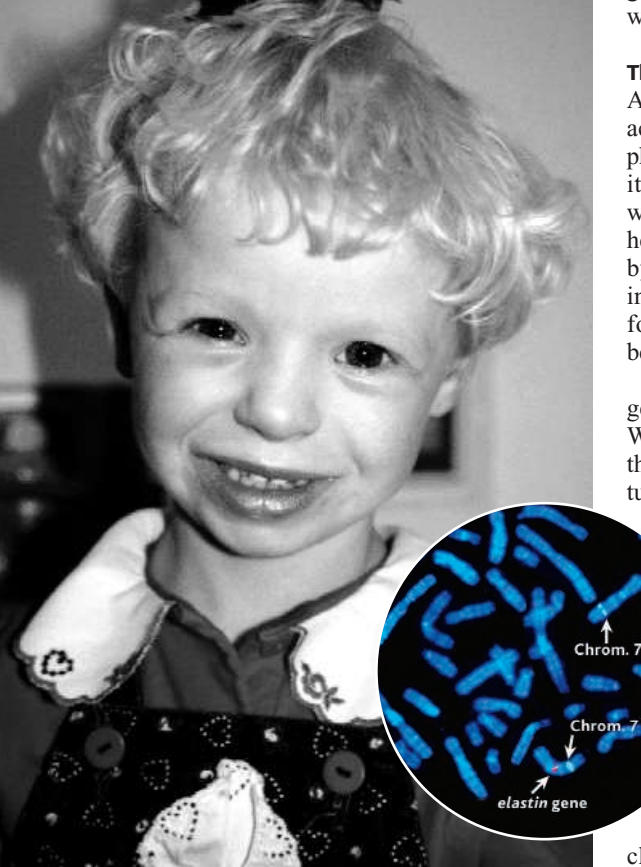
Cognitive window. Most individuals with Williams syndrome share distinctive facial features ( above ) and the same set of physical and mental impairments. The disorder is caused by the deletion of a segment of one copy of chromosome 7, including the elastin gene.

to identify the roles that the different genes within that section play in the development and functioning of the brain. The broader goal of these efforts has been to learn how